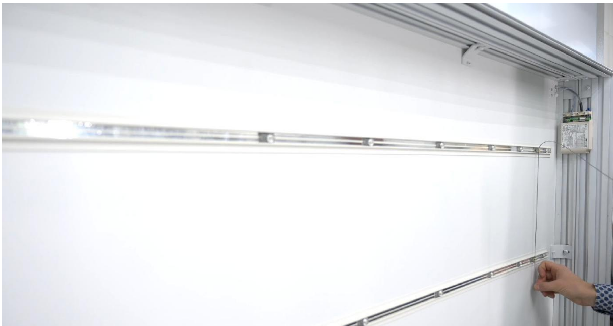
Backlighting to light large surfaces, for example like posterboxes.